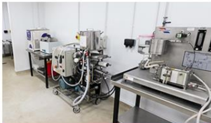
Food Industry Centre High Care