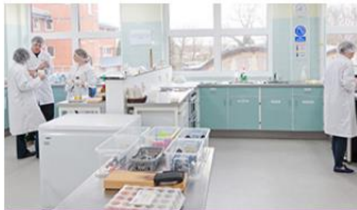
Consumer Science Kitchen 1