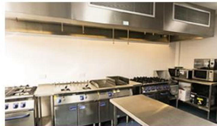
Consumer Science Kitchen 2