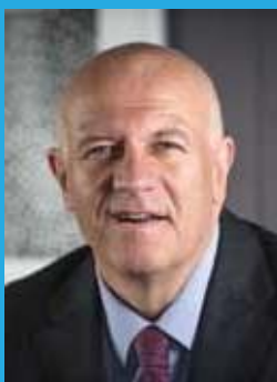
Vice Chancellor, University of Bedfordshire, UK