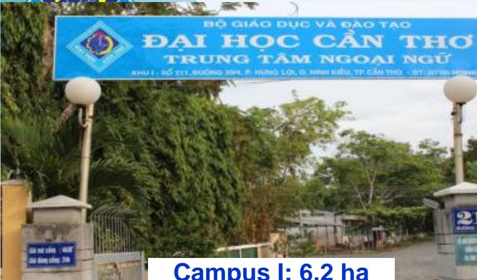
Campus I: 6,2 ha