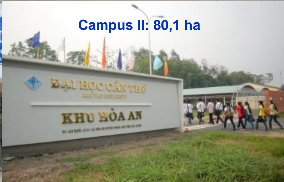
Campus IV: 112 ha