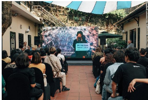
UK/Viet Nam Season Closing ceremony – April 2024