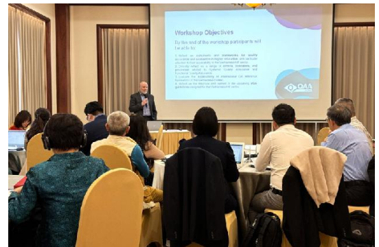
Training on quality assurance and accreditation