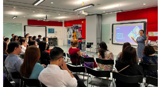
A briefing session for agents about Agent Quality Framework (AQF) and UK visa policy