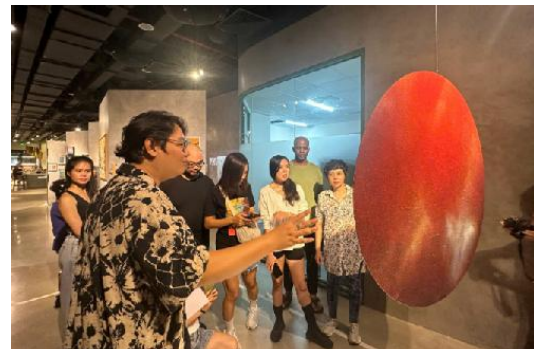
Ha Noi Nghệ Văn exhibition, supported by Culture Connects Small Grants