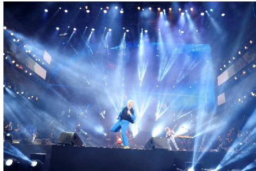
Scottish band The Big Day headlines at Hozo International Music Festival, Ho Chi Minh City