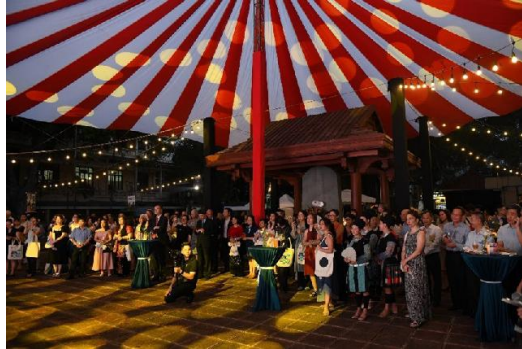
UK/Viet Nam Season Opening ceremony – June 2023

For more information about the program, please visit: https://www.britishcouncil.vn/en/programmes/uk-vietnam-season-2023