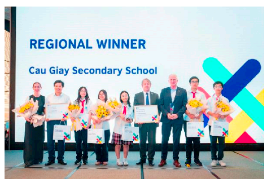
British Council partner schools – a network with more than 2,300 schools that deliver UK international exams