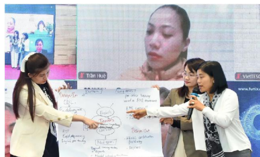
Lectures and teachers share solutions to make English a second language in schools