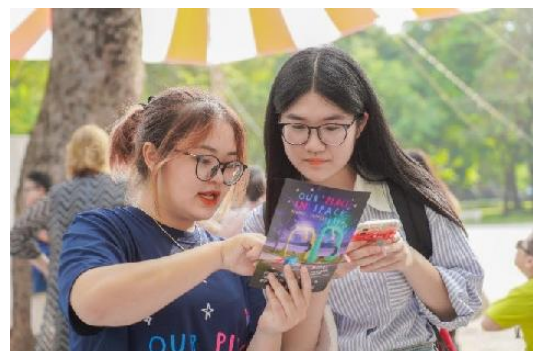
Audience at Our Place in Space public event, a collaboration by Ha Noi–based Think Playgrounds and Nerve Centre from Northern Ireland, supported by the UK/Viet Nam Season