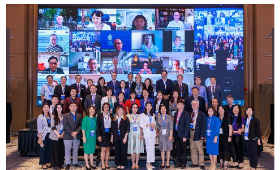
Roundtable on Innovating TNE: Building stronger UK–Viet Nam partnerships for the future