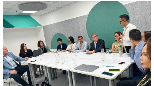
Agents Support Group in the meeting with UKVI to share customers' feedback of their experiences when applying for UK student visa