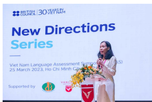
Viet Nam Foreign Language Testing Conference (VLAS) – part of the New Directions International Conference on Foreign Language Testing