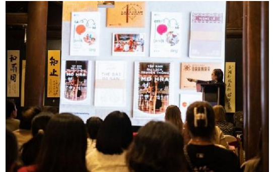
Symposium and Showcase Programme Living Heritage and Sustainable Development, Heritage of Future Past Project.