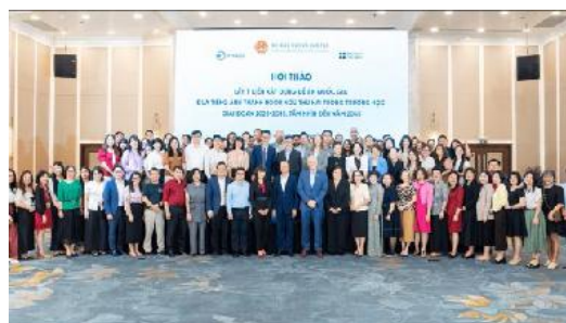
More than 80 delegates, representing the Ministry of Education and Training (MOET), and international education/ELT organisations, participated in a half-day consultation meeting on the draft strategy of making English as a second language in the school system.