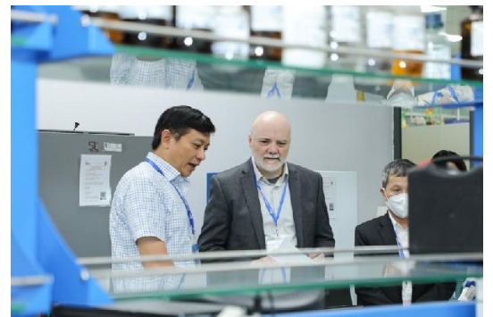
Gap analysis at a Viet Nam higher education institution