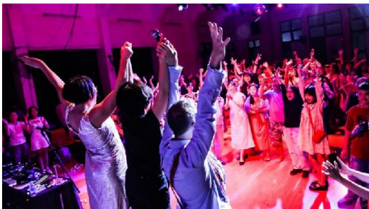
Circus theatre performance and training from The Rest of Our Life in Ha Noi and Ho Chi Minh City.