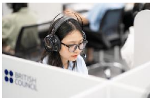
IELTS - The world's most popular English language test