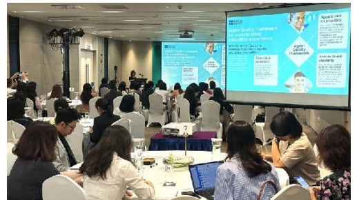
Agent Annual Meeting 2024