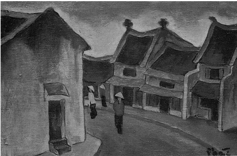
BUI XUAN PHAI